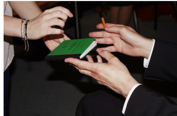
STUDENT RECORD BOOK