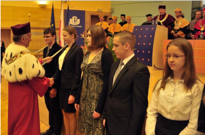
INAUGURATION OF ACADEMIC YEAR